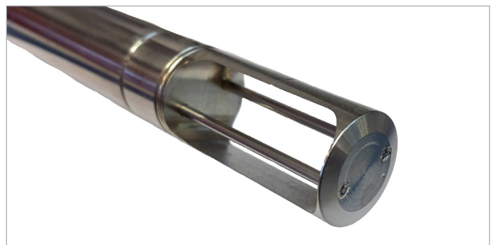
The Fox Thermal DDC-Sensor™ eliminates the sensor element vibration which can lead to metal fatigue and failure.

The Reference RTD measures the gas temperature. The instrument electronics heat the mass flow sensor, or heated element, to a constant temperature differential (constant \Delta T ) above the gas temperature and measures the cooling effect of the gas flow. The electrical power required to maintain a constant temperature differential is directly proportional to the gas mass flow rate. The microprocessor linearizes this signal to deliver a linear 4-20mA signal.